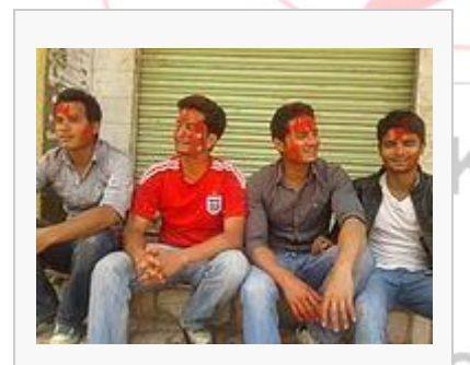
Holi Nepal (2011)