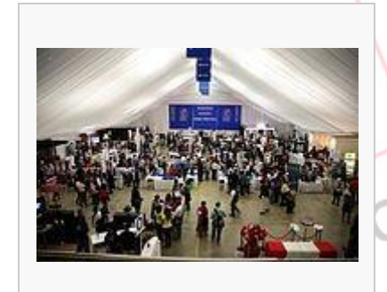
Soweto Wine Festival, South Africa (2009)