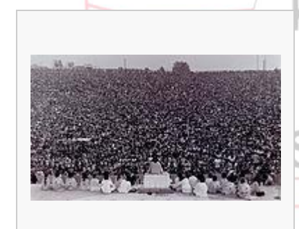
The opening ceremony at the Woodstock rock festival,