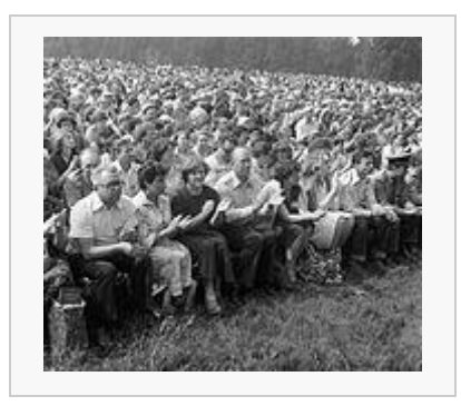
<u>Pushkin</u> Poetry Festival,