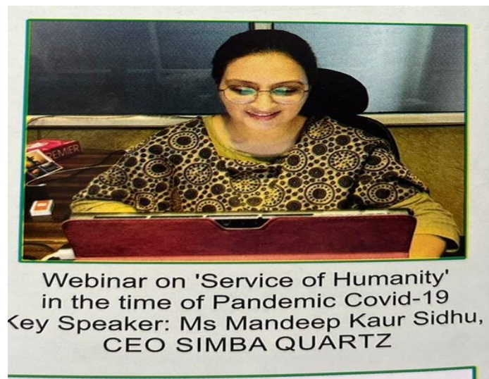
Online Training (Covid Volunteers) on Pandemic Covid-19 on August 8, 2020

were suffered and faced unlimited problems in this phase. It is the moral duty of every NSS volunteer to help and serve the grief-stricken people of our society. Mutual coordination among people is very necessary to fight against this deadly disease. About 56 students took part in the training.