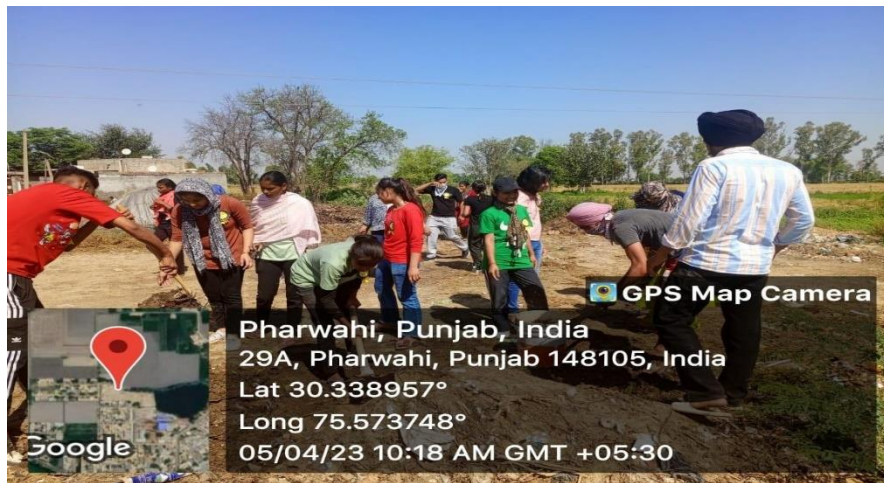
Seven Day and Night Camp at Village Pharwahi (4 th -10 th April 2023)