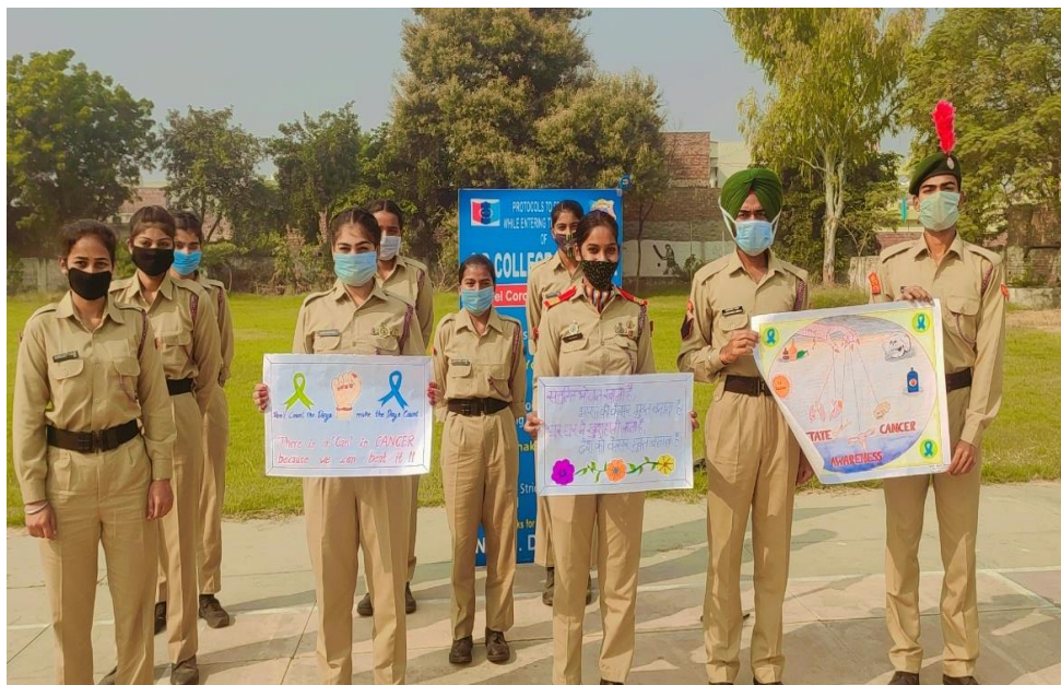
Cancer Awareness Rally and Competitions held on 7 Dec., 2020.

NCC Unit of S.D. College Barnala celebrated “Cancer Awareness Day” on 7 Dec., 2020. On this day poster making competition has been organized. During this activity cadets and college students made posters and pasted them in the city to aware locals about this dreaded disease. About 23 students participated in the event.