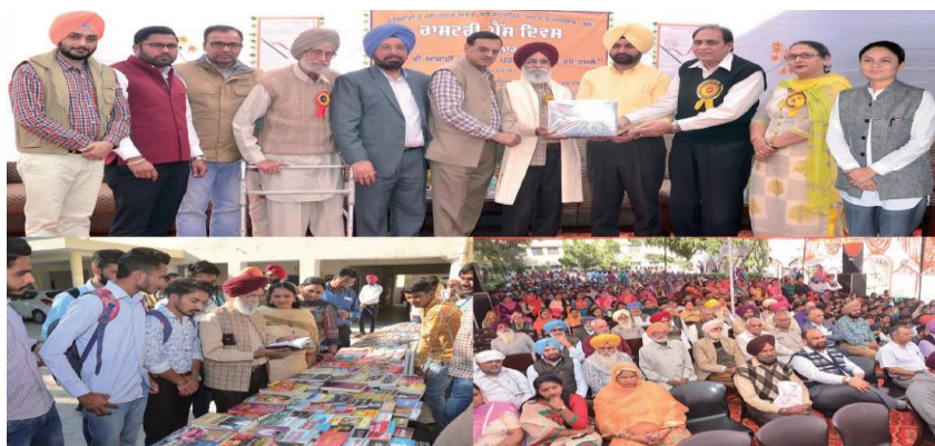
Glimpses of “Press Day” held on 22 November 2018