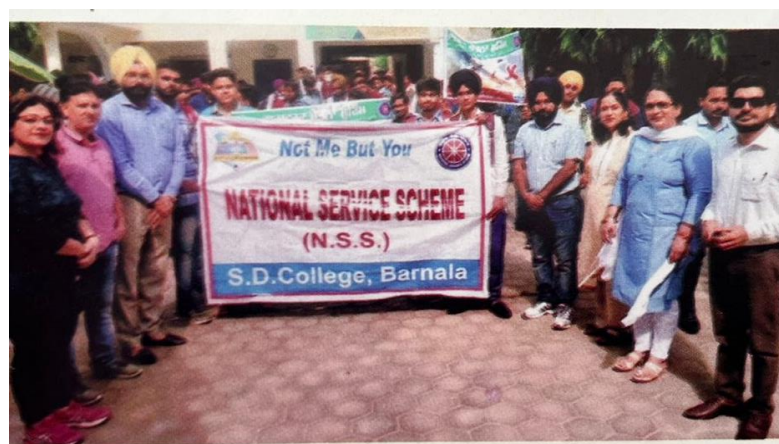
Environment awareness rally against stubble held on 4 th October 2019

NSS unit organised an environment awareness rally against stubble burning in adjoining villages Pharwahi, Dangarh, Kattu and Uppli on 4 th October 2019. Volunteer interacted with local farmers and made aware them about the ill effects of smoke produced during stubble burning. More than 60 individuals including staff and students participated in the event.