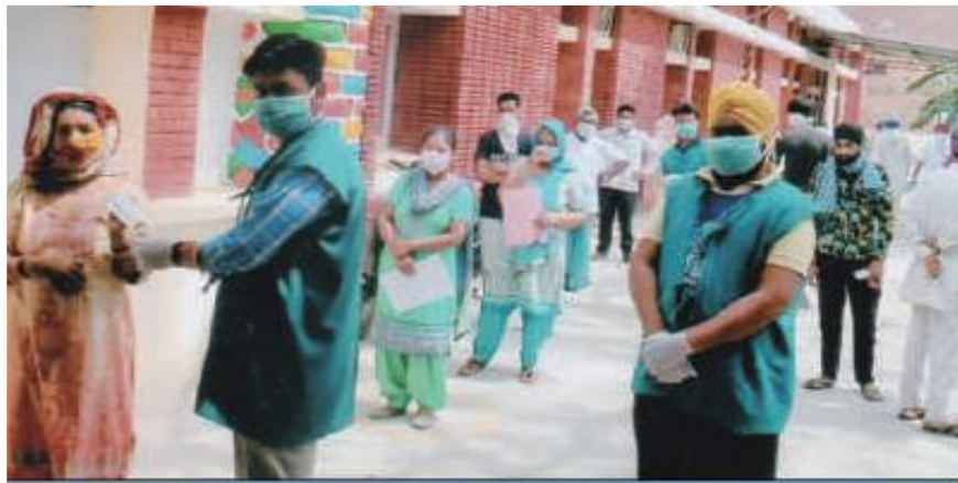
Social Services during Covid-19 Pandemic (April and May, 2020)

welfare of migrant labourers, they contributed in the community kitchen & provided them things of basic necessities. About 8 students volunteered for the services.