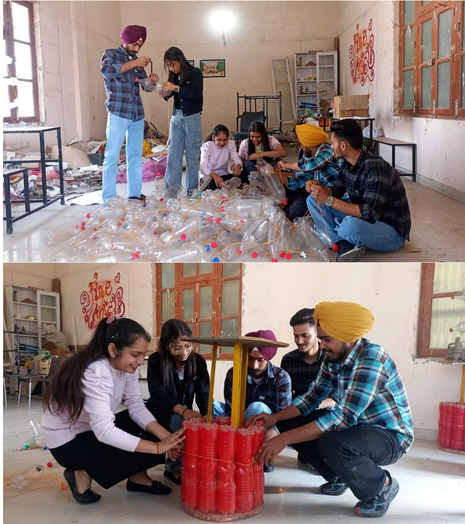
Awareness Campaign regarding Reuse of Plastic on 10 th February 2023

NSS Volunteers from S.D. College initiated a project on 10 th February 2023 of re-using plastic bottles collected from various garbage sources. They made hanging vertical garden with used plastic bottles. The purpose of the event was to make students aware about the conservation of their surrounding by using used plastic for various purposes. There were almost 40 volunteers who participated in the drive.