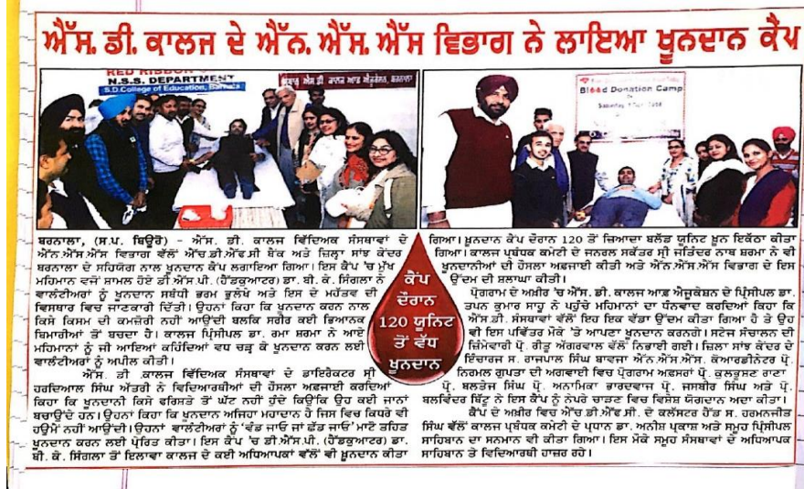
News Cutting of the event “Blood Donation Camp” held on Dec. 1 st , 2018