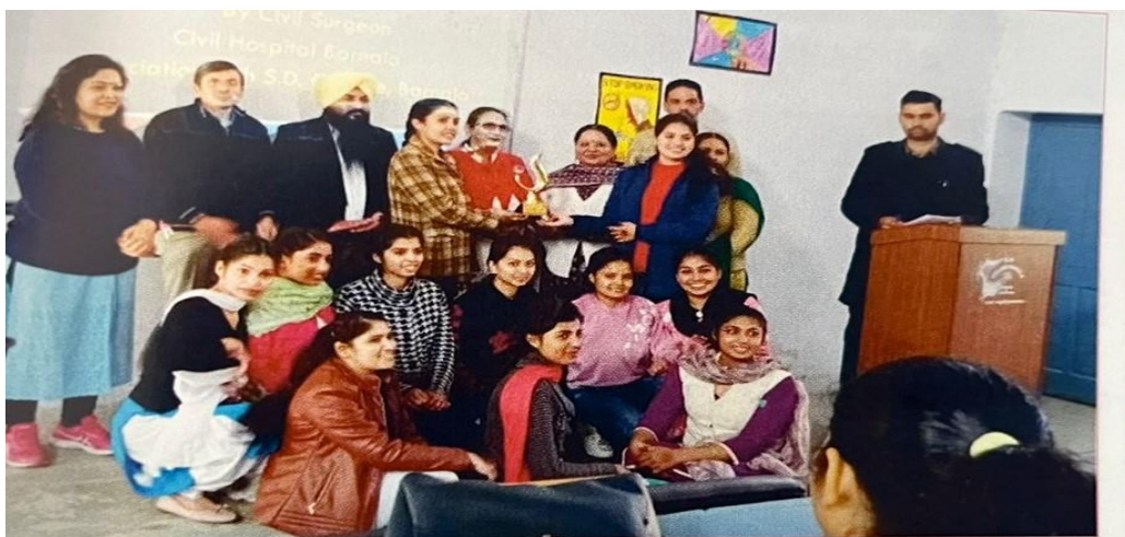
Awareness Program against “Tobacco Use” held on June 6, 2021

Awareness Program against Tobacco Use was organised on June 6, 2021. Students took a pledge for not taking Tobacco and other drugs which are injurious to health. Students were appealed to make aware the other people of society also such as neighbours, community workers and their friends. Poster-making and slogan writing competitions were held on this topic. About 130 students participated in the event.