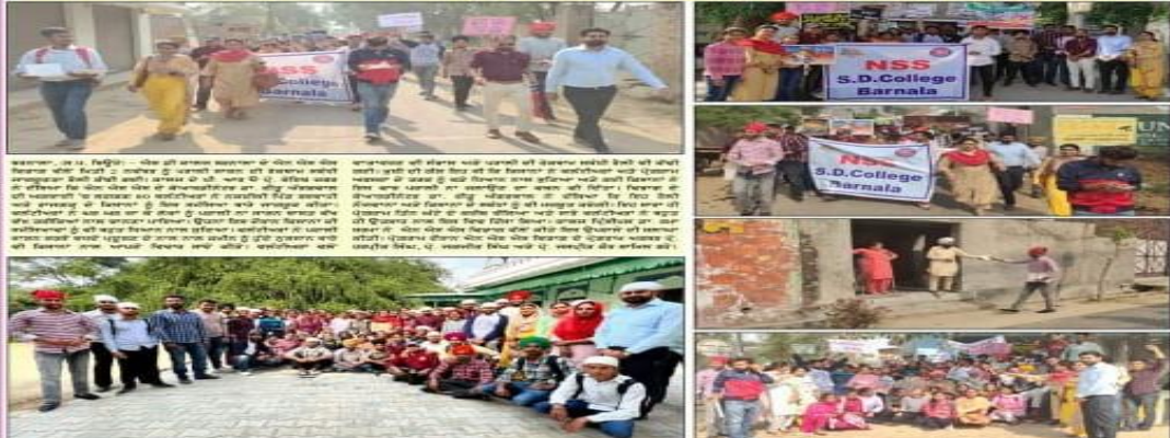
News cutting of rally regarding “Stubble Burning Awareness” on 2 nd November 2021

ਫਰਵਾਹੀ ਤੇ ਰਾਜਗੜ੍ਹ ਪਿੰਡਾਂ 'ਚ ਕਿਸਾਨਾਂ ਨੂੰ ਪਰਾਲੀ ਸਾੜਨ ਨਾਲ ਹੋ ਰਹੇ ਨੁਕਸਾਨਾਂ ਪ੍ਰਤੀ ਸੁਚੇਤ ਕੀਤਾ