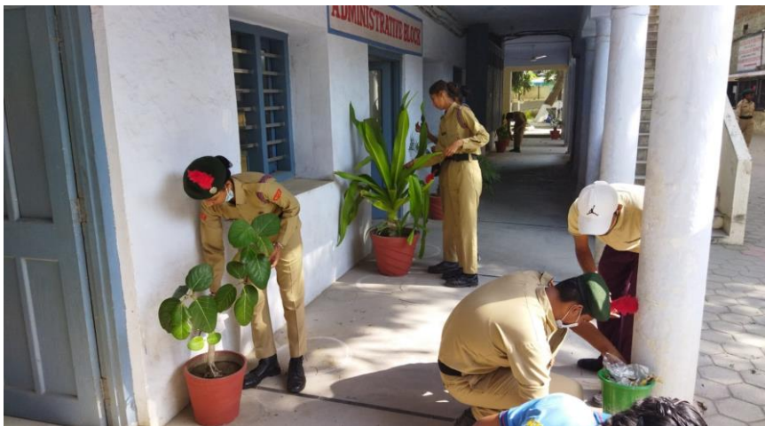
Conservation Drive to Save the Plants and Trees in the month of September, 2021

To save plant and trees of the campus and surroundings, NCC unit of the college carried out in the month of September, 2021. During this event, NCC cadets carried out tilling, deweeding and manuring of plants. About 45 students took part in the event.