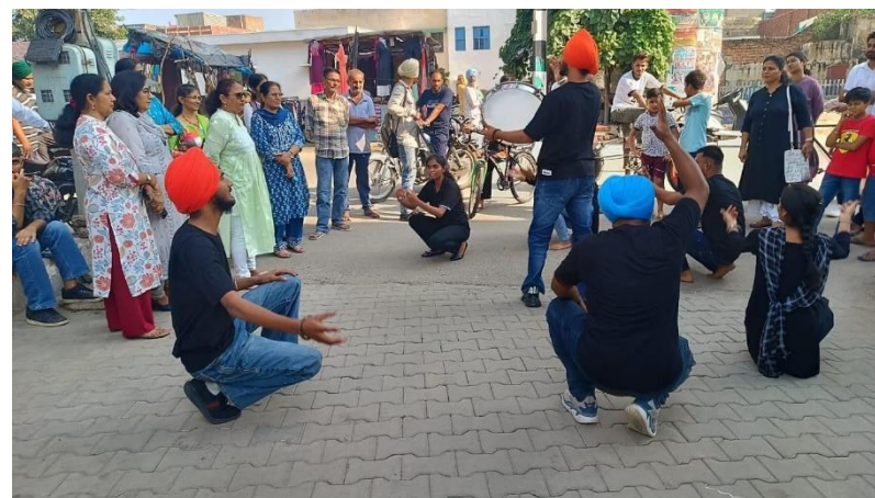
Glimpses of Cycle Rally, Symposium and Nukkad Natak on 28th September, 2022