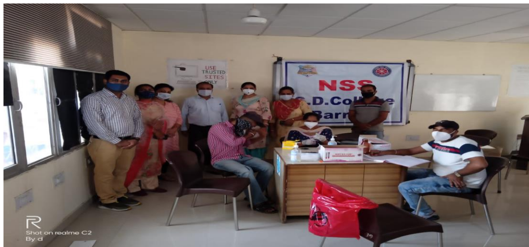
Glimpses of “COVID Vaccination Drive Camp-III” on 7 th August, 2021

NSS department organized 3 rd Corona vaccination camp in collaboration with District Health department on 7 th August, 2021. The camp was held to vaccinate the students before the commencement of offline classes. Around 200 students and staff members were vaccinated.