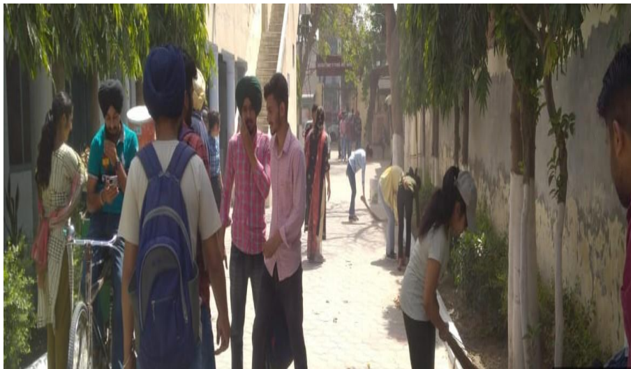
Cleanliness drive in month of October, 2021

During the month of October 2021, NCC cadets carried out the cleanliness drive in the College campus and vicinity. About 78 students took part in the event.