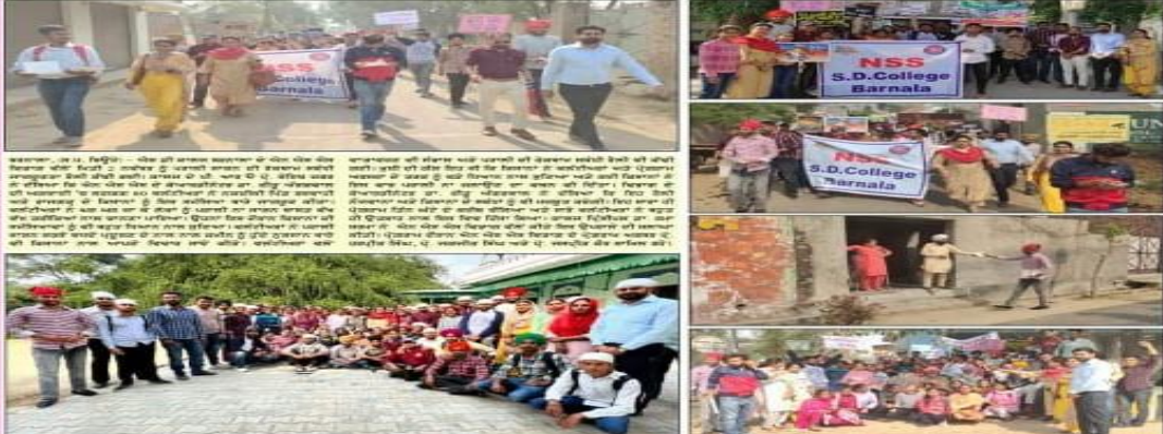
News cutting of rally regarding “Stubble Burning Awareness” on 2 nd November 2021