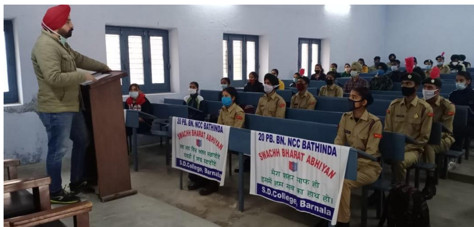
Extension lecture on the theme of "Health and Hygiene" on 14-12-2020

An extension lecture has been organized on the theme of "Health and Hygiene" to celebrate 'Swachhta Pakhwara' on 14-12-2020. In this lecture the various issues of health and Hygiene were discussed. Further, students were motivated to spread this awareness among the families and society for the betterment of the nation. About 50 students participated in the event.