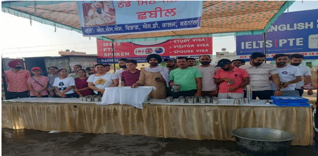
Glimpses of Sweet Water offerings (Chabeel) on 3 rd June 2022