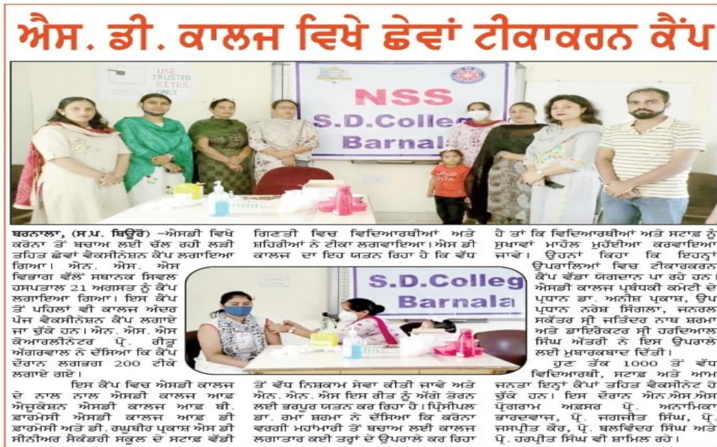
News cutting of “COVID Vaccination Drive Camp-VI” on 21 st August, 2021

On 21 st August 2021 NSS department collaboration with Civil hospital Barnala held its 6 th consecutive corona vaccination camp in the college campus. 200 people including staff members from other institutes of S.D. Educational Institutions, citizens and students took advantage of this camp and got vaccinated. 200 people including students get vaccinated in the camp.