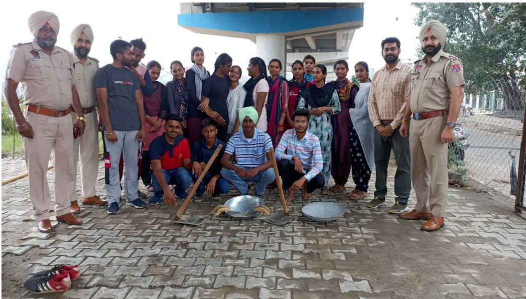
One Day NSS Camp

To instil the dignity of manual labour and to promote the essence of NSS motto ‘NOT ME BUT YOU’ NSS department organized a one day camp in college campus on 29 th March 2022. 160 volunteers beautified the campus/surroundings such as Kacheri Chowk and did various cultural activities like singing and shared their views on social issues like female foeticide.