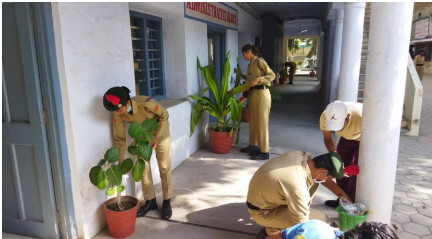
Conservation Drive to Save the Plants and Trees in the month of September, 2021

To save plant and trees of the campus and surroundings, NCC unit of the college carried out in the month of September, 2021. During this event, NCC cadets carried out tilling, deweeding and manuring of plants. About 45 students took part in the event.