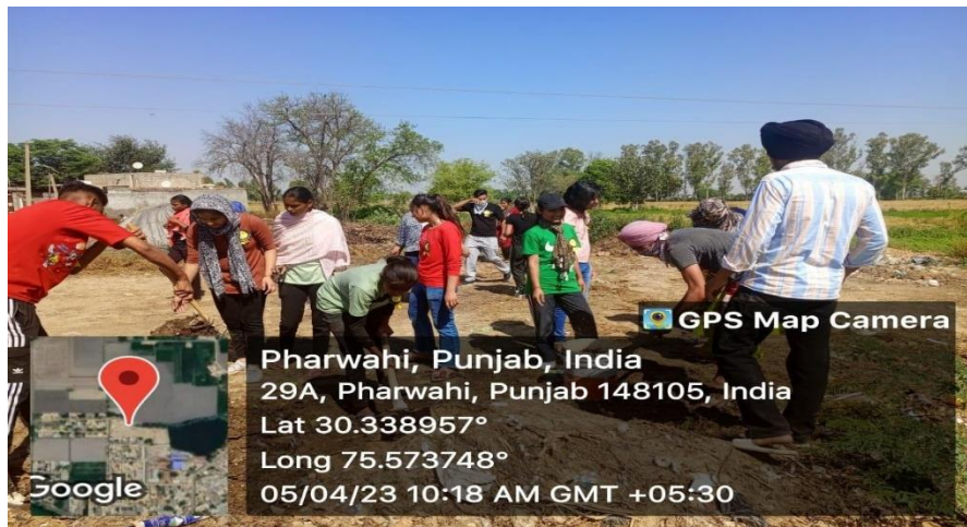
Seven Day and Night Camp at Village Pharwahi (4 th -10 th April 2023)