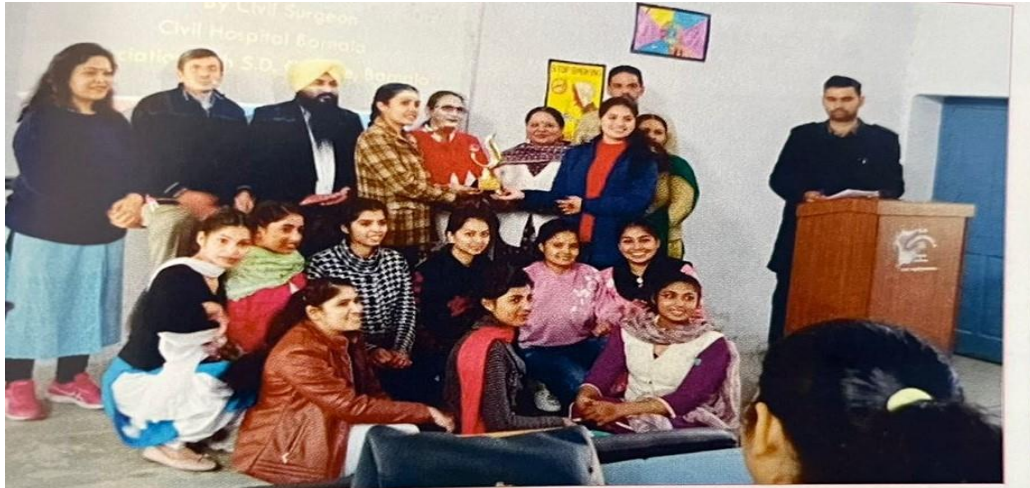
Awareness Program against “Tobacco Use” held on June 6, 2021

Awareness Program against Tobacco Use was organised on June 6, 2021. Students took a pledge for not taking Tobacco and other drugs which are injurious to health. Students were appealed to make aware the other people of society also such as neighbours, community workers and their friends. Poster-making and slogan writing competitions were held on this topic. About 130 students participated in the event.