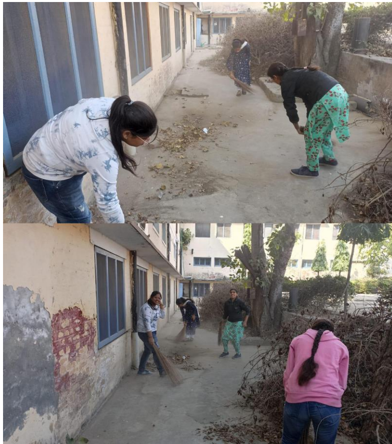
Cleanliness Drive (26 th Nov., 2022)

BUT YOU". During this camp 120 volunteers participated in the cleanliness drive and also planted 115 saplings in college and its surroundings.