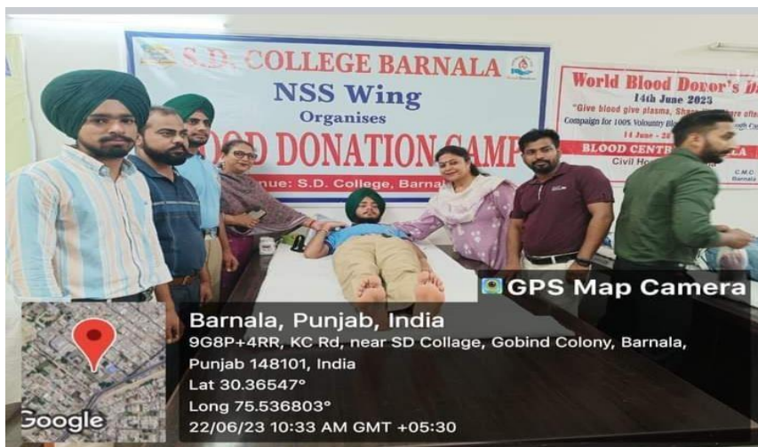
Blood Donation Camp on 22 nd June

NSS wing in collaboration with NCC Wing of the college organized Blood Donation Camp on 22 nd June, 2023 under the drive “ Organization of World Blood Donor Day 2023 ”. Faculty members, NSS and NCC volunteers donated 31 units of blood. The medical team, Civil hospital Barnala assisted in organizing this camp. The purpose of the camp was to instill the feeling of empathy for their fellow human beings among volunteers. Volunteers were sensitized about their responsibility for the community and society. The camp was successful in breaking away certain myths regarding blood donation. About 150 students took part in the event.