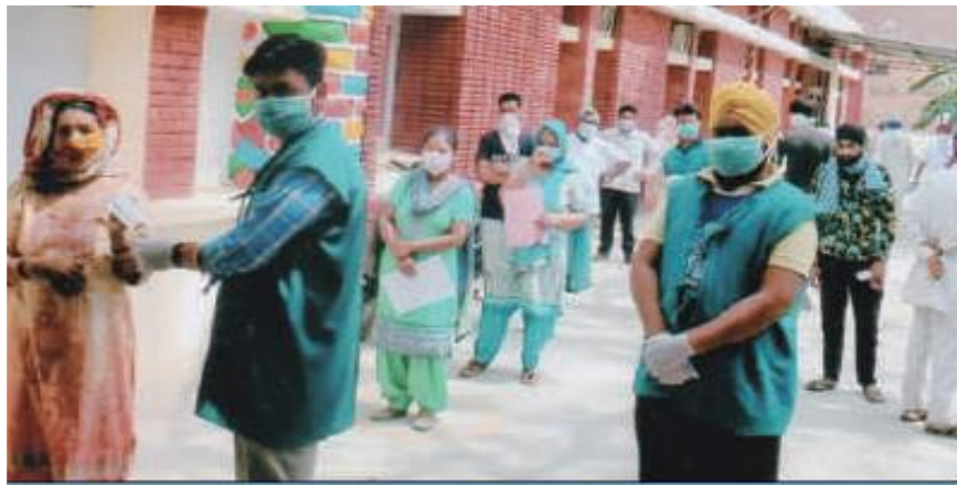
Social Services during Covid-19 Pandemic (April and May, 2020)

welfare of migrant labourers, they contributed in the community kitchen & provided them things of basic necessities. About 8 students volunteered for the services.