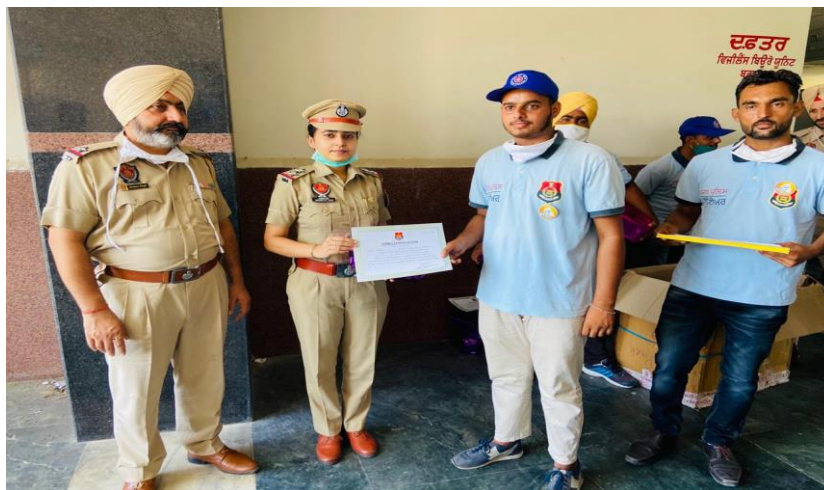
Awareness Campaign regarding Covid-19 Apps during Lockdown (Year 2020)

During the beginning of Pandemic Covid 19, NSS volunteer SD college Barnala in collaboration with District Administration Barnala assisted the people to download the Arogya Setu App and Covid 19 Apps. They took out this awareness drive from door to door also. Some volunteers also assisted Punjab police during lockdown. About 39 students volunteered for the awareness campaign.