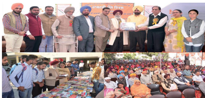
Glimpses of “Press Day” held on 22 November 2018