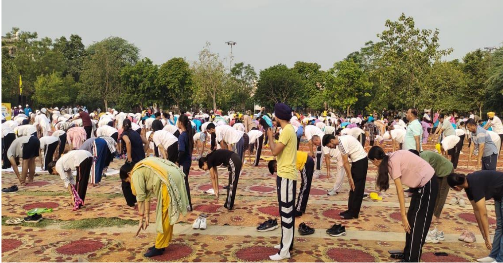
9 th International Yoga Day on 21 st June 2023,

collaboration with District administration at Shaheed Bhagat Singh park. 35 NSS volunteers participated in this event along with their programme officers. The theme of the day was “Har Ghar Aangan, Karo Yog Raho Nirog”. Along with different Asanas like Taar asana, Sukhasana and Surya Namaskar various breathing techniques were taught.