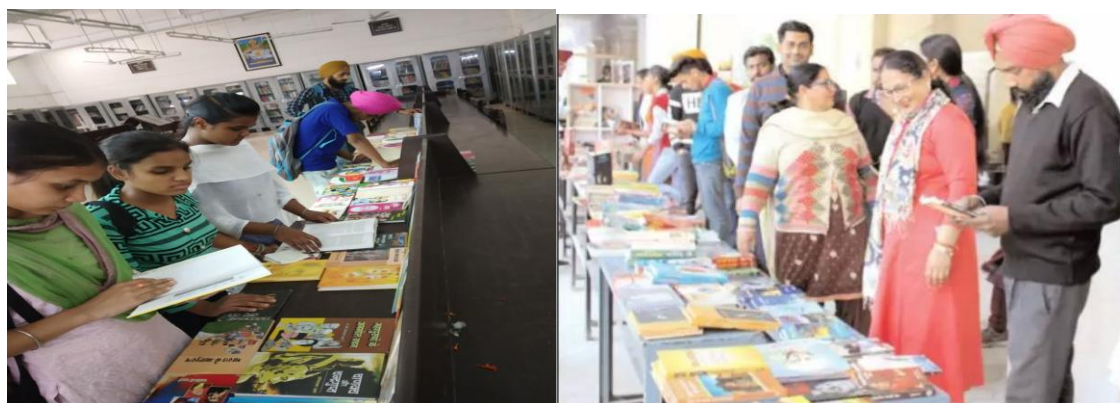
Glimpses of the book exhibition related to Freedom Struggle on 15 August, 2018.

The College Organised a Book Exhibition related to Freedom Struggle on 15 August, 2018. This exhibition included the books on different Freedom fighter in our freedom struggle. It was open exhibition in which citizens and students from different institution participated. More than 400 individuals participated in the event.