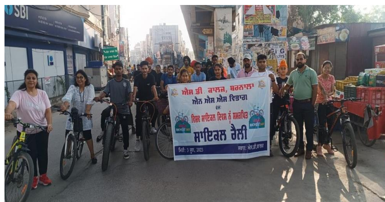
Awareness Cycle Rally on 3 rd June 2023