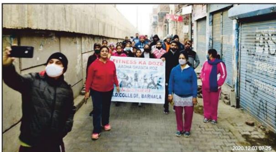
Awareness Rally on "Fit India" on Dec. 3, 2020

NSS Department organized a rally on "Fit India" on Dec. 3, 2020. The main motive of this rally was to describe preventive measures against spreading of Coronavirus disease. More than 100 students participated in the event.