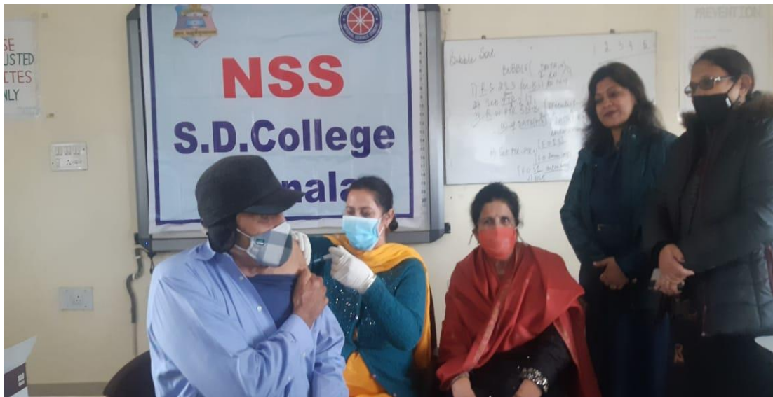
Glimpses of “COVID Vaccination Drive Camp-VII” on 14 Jan, 2022

On 14 th January, 2022, NSS department collaboration with Civil hospital Barnala organized its eighth corona vaccination camp in association with civil hospital Barnala. Around 150 students and citizens got vaccinated in the camp.