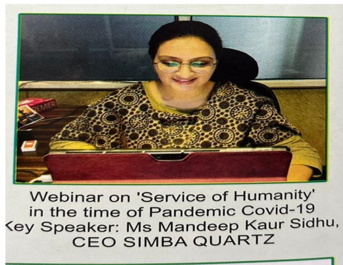
Online Training (Covid Volunteers) on Pandemic Covid-19 on August 8, 2020

were suffered and faced unlimited problems in this phase. It is the moral duty of every NSS volunteer to help and serve the grief-stricken people of our society. Mutual coordination among people is very necessary to fight against this deadly disease. About 56 students took part in the training.