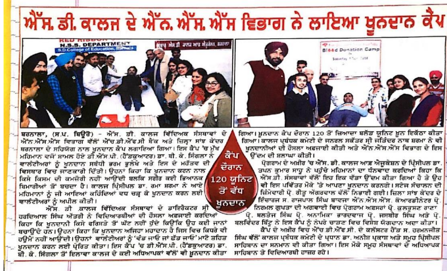
News Cutting of the event “Blood Donation Camp” held on Dec. 1 st , 2018