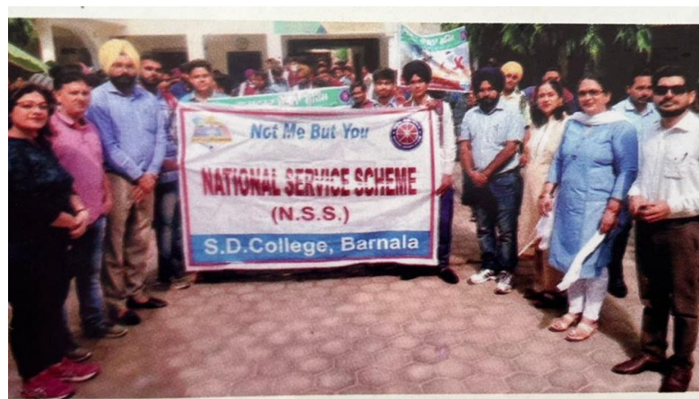
Environment awareness rally against stubble held on 4 th October 2019

NSS unit organised an environment awareness rally against stubble burning in adjoining villages Pharwahi, Dangarh, Kattu and Uppli on 4 th October 2019. Volunteer interacted with local farmers and made aware them about the ill effects of smoke produced during stubble burning. More than 60 individuals including staff and students participated in the event.