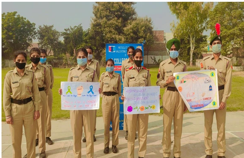
Cancer Awareness Rally and Competitions held on 7 Dec., 2020.

NCC Unit of S.D. College Barnala celebrated “Cancer Awareness Day” on 7 Dec., 2020. On this day poster making competition has been organized. During this activity cadets and college students made posters and pasted them in the city to aware locals about this dreaded disease. About 23 students participated in the event.