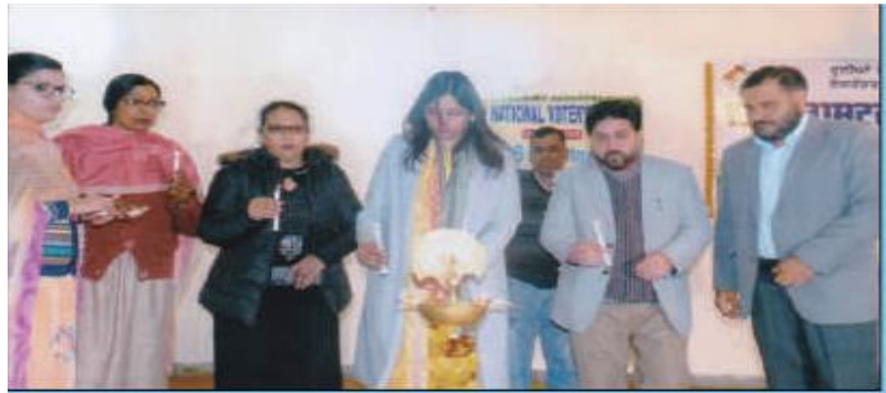
Seminar on National Voter Day (25 th Jan., 2020)

On the occasion of National Voter Day (25 January, 2020), SD College Barnala, organised seminar in which Deputy Commissioner Shri Teg Partap Phoolka honoured PWD employees for their services in issuing voter card. Besides this, chief guest also honoured people who offered their services during Lokh Sabh election 2019. Students presented skit on this occasion. Student were motivated to cast their vote and strengthen the democracy. About 130 individuals participated in the event.