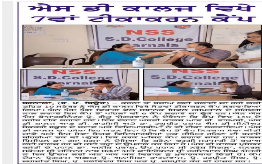
News cutting of “COVID Vaccination Drive Camp-VII” on 10 th September, 2021