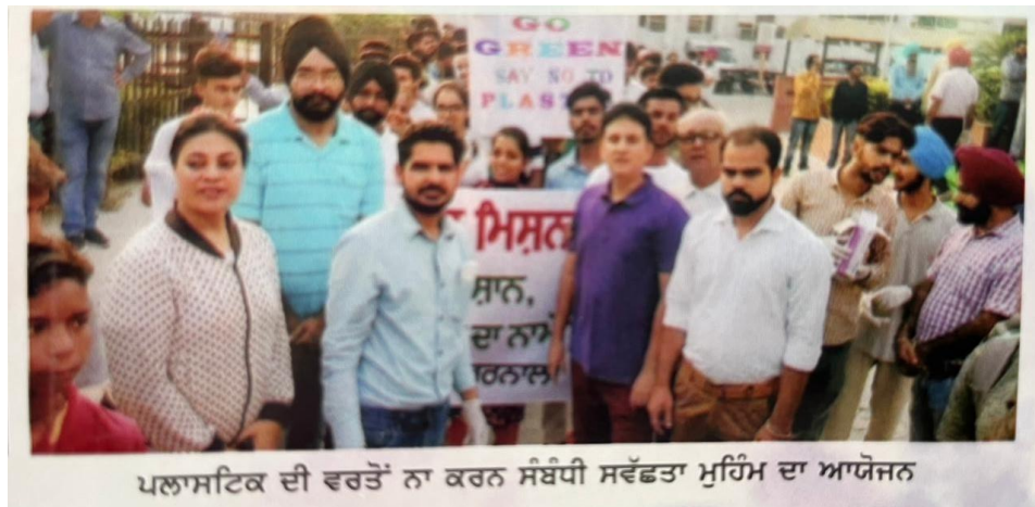
Rally on ‘No plastic Movement’ held on October 2 nd , 2019”

Volunteers of NCC/NSS and Program Officers participated in the rally on ‘No plastic Movement’ on October 2 nd , 2019 conducted by District Administration volunteers collected plastic Bags and envelops from the entire city and spread the message of ‘No plastic’ among the citizen of Barnala. Around 150 volunteers participated in the awareness program.