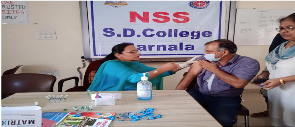
Glimpses of “COVID Vaccination Drive Camp-V” on 14 th August, 2021