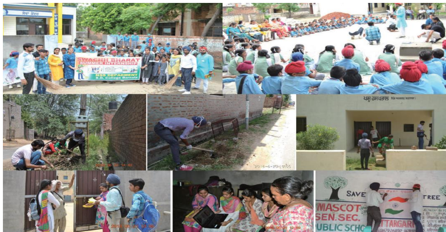
Glimpses of the event “Swachh Bharat Abhiyan Camp” held on 14 July, 2018

As per the directives of HRD Ministry and Punjabi university Patiala, under “Swachh Bharat Abhiyan” on 14 July, 2018. Summer camp was organised in Village Attargarh, District Barnala. NSS Volunteers organised Nukkad Natak (Street Play) in the village and chart competition in the Govt Primary School. Besides this, volunteers performed cleanliness drive in the village and made aware the people about general cleanliness. About 10 students and 2 staff members participated in this event.