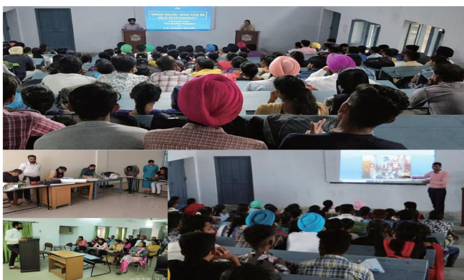
Glimpses of awareness event “Buddy Program” held on 23 March, 2019.

With the mission to fight against Drug Abuse in state, The Govt of Punjab have been running first of its kind initiative called Buddy Program. Under this Program, the college organised many activities like lecture, debate competition, poster competition and PPT presentation on 23 March, 2019. The Buddy program aims to educate student about the ill effects of drug abuse and generates positive peer influence. Student developed knowledge, right attitude and behaviour along with skills to prevent drug abuse. This program is key to Punjab fight against drugs as it covers the adolescent age groups and young adults. More than 800 students participated in the event.