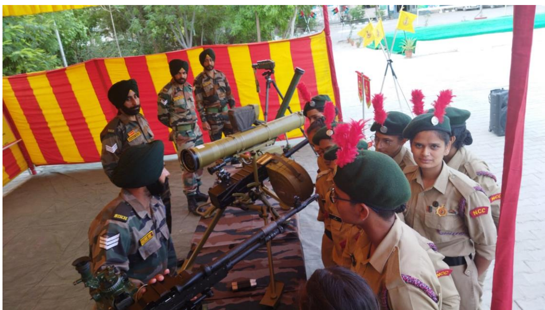
Weapon Training to girls under NCC