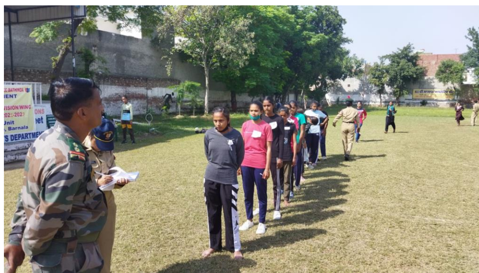
Enrollment of girls for NCC