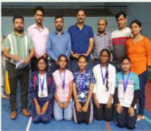
Chess Team, Silver Medal in Khedan Watan Punjab Dian