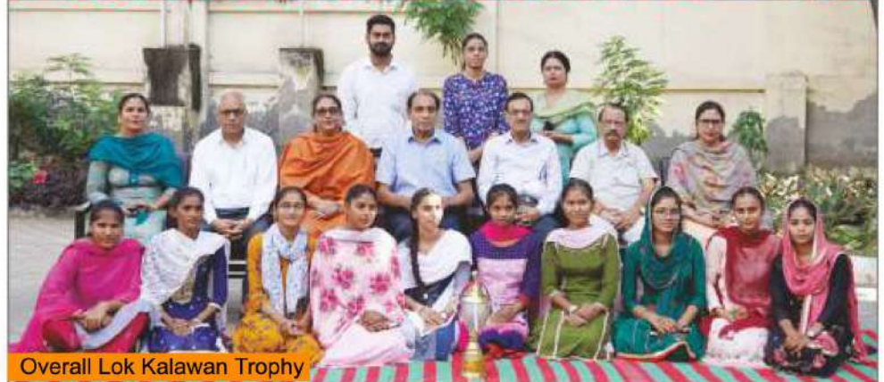
Overall Lok Kalawan Trophy