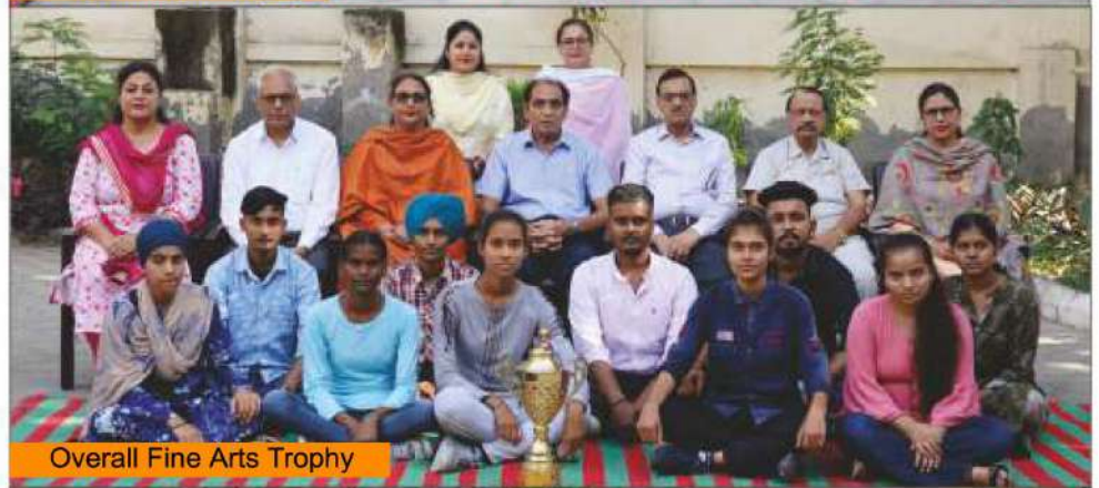
Overall Fine Arts Trophy