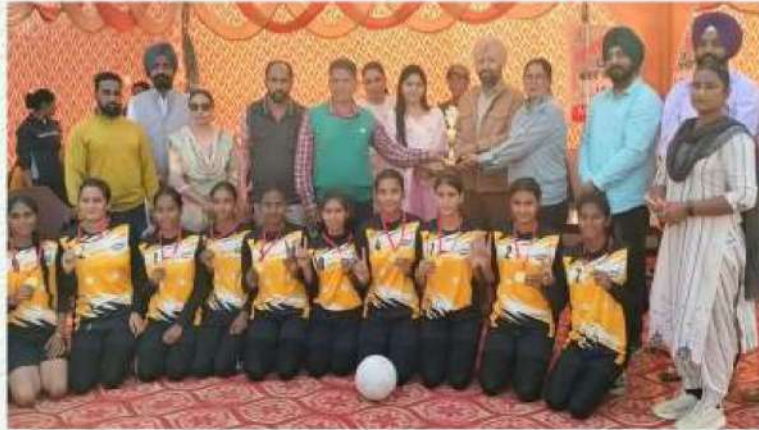
Netball Team, University Champion at Mata Sundri University Girls College Mansa