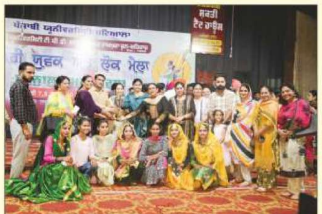
The day was filled with fervour and excitement amidst thrills, shills and cheers