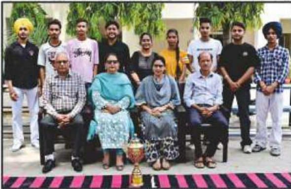
Folk Orchestra Team, 1st Position