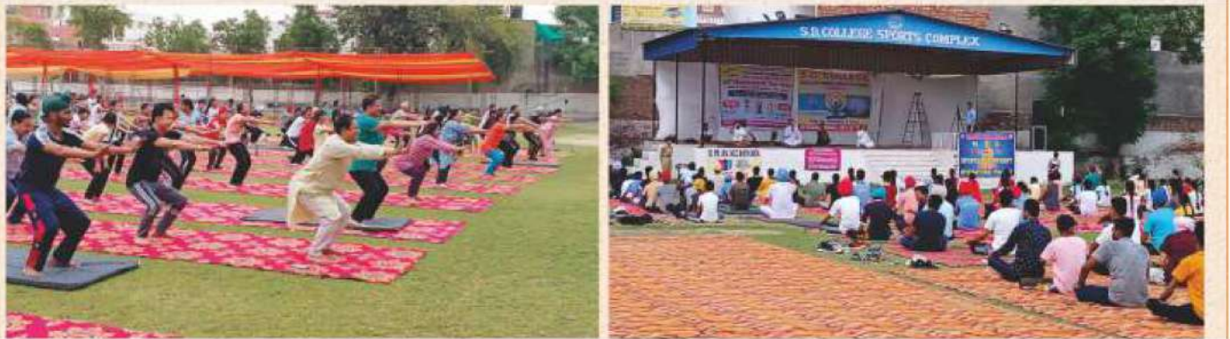
International Yoga Day was celebrated by NSS, NCC and Sports depts on college campus.