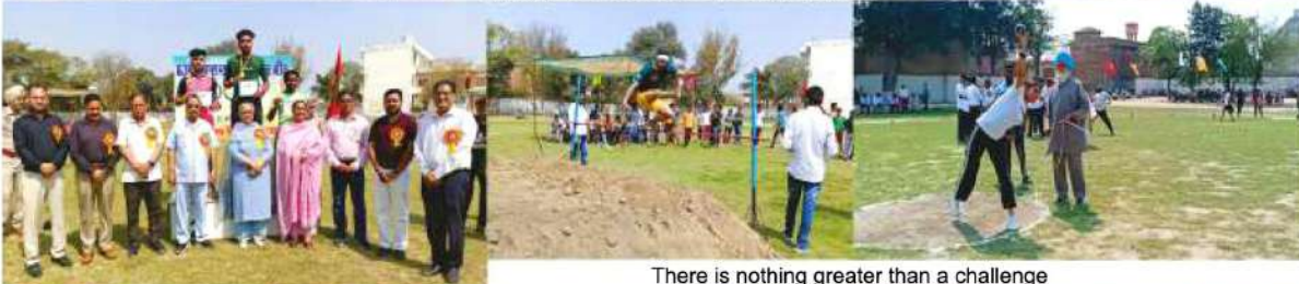
There is nothing greater than a challenge