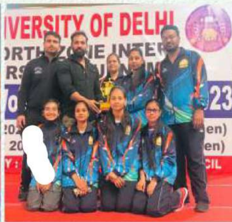
Chess Team, 11th Position North Zone Inter Uni. at Pbi. Uni., Patiala