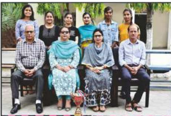
Group Song Western Team, 2nd Position