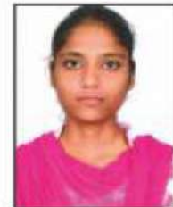
AKANKSHA (CHESS) Inter College (Gold) Silver in State