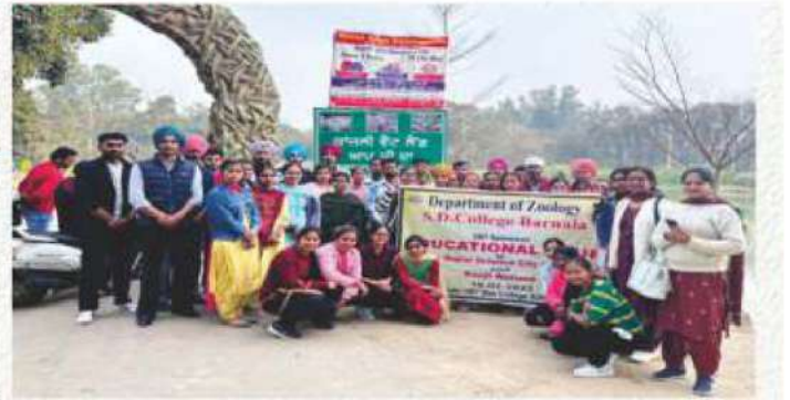
Students at Kanjli Wetland