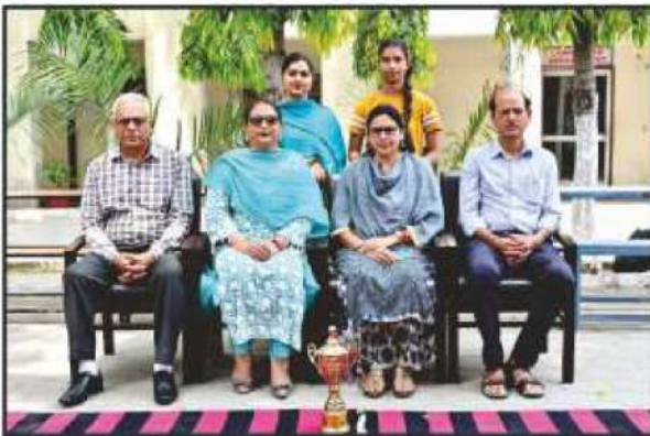
Kavishri Team, 2nd Position