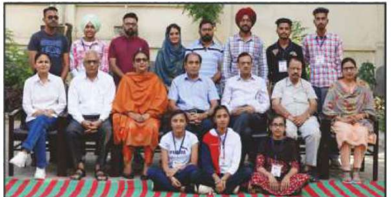
Samaj Te Patrakar (STP) Team