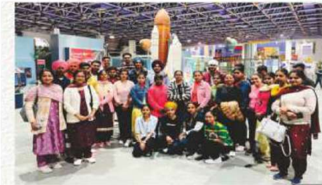
Students at Pushpa Gujral Science City, Kapurthala