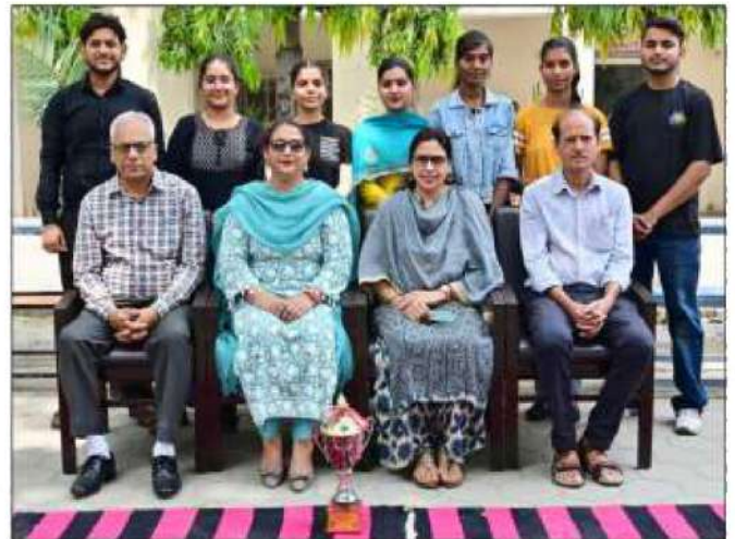
Group Song Indian Team, 1st Position