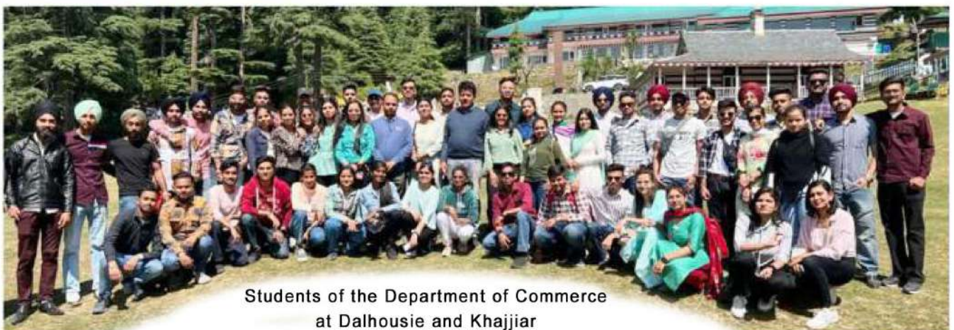
Students of the Department of Commerce at Dalhousie and Khajjiar

A Standard Writing Competition was also organised by the BIS Club in which students participated with great fervour.