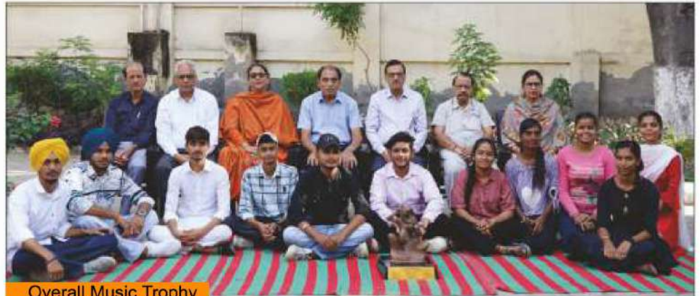
Overall Music Trophy

Our college grabbed First Position in nineteen Items Giddha, Laghu Film, Classical Instrument (NP), Classical Instrument(P), Quiz, Western Instrumental Solo, Western Vocal Solo, Group Shabad, Group Song Indian, Lok Saaz, Nala Bunana, Chhiku Banai, Mitti De Khidone, Folk Orchestra, Mimicry, Pehrawa Pardarshini, Rangoli, Cartooning and Debate, Second Position in six items: Bhangra, Western Group Song, One Act Play, Kavishari, Kroskiye Di Bunti, Peerhi Di Bunai. Third Position in eleven Items: Geet/Ghazal, Skit, Nukar Natak, Photography, On the spot Painting, Clay Modelling, Installation, Lok Geet, Rassa Vatai, Kali Gayan and Vaar Gayan.