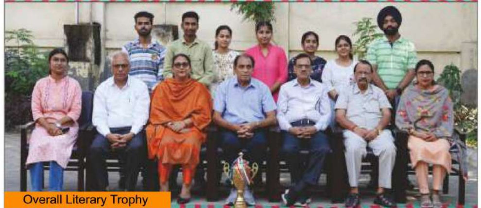
Overall Literary Trophy