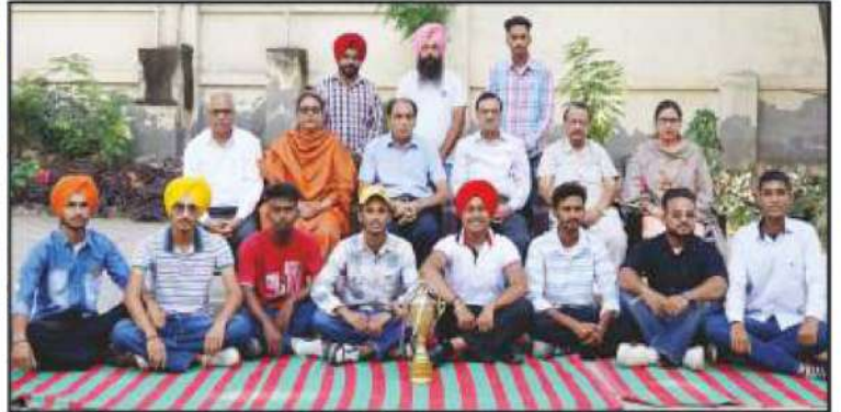
Bhangra Team, 2nd Position