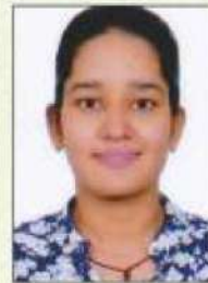
Sharuti Ist in Classical Inst. (NP) Zonal Youth Festival