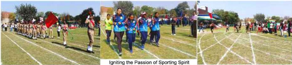
Igniting the Passion of Sporting Spirit