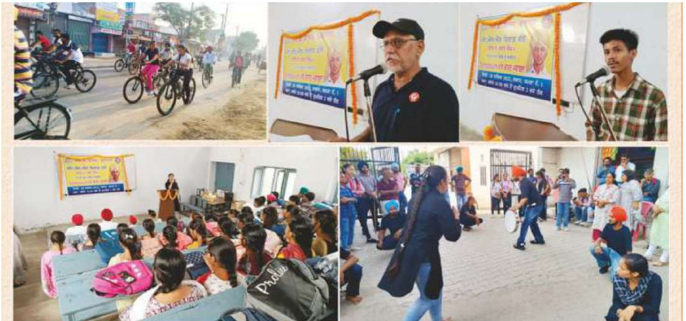
In connection with Shaheed Bhagat Singh's birthday, cycle rally, speech competition and street plays were conducted.