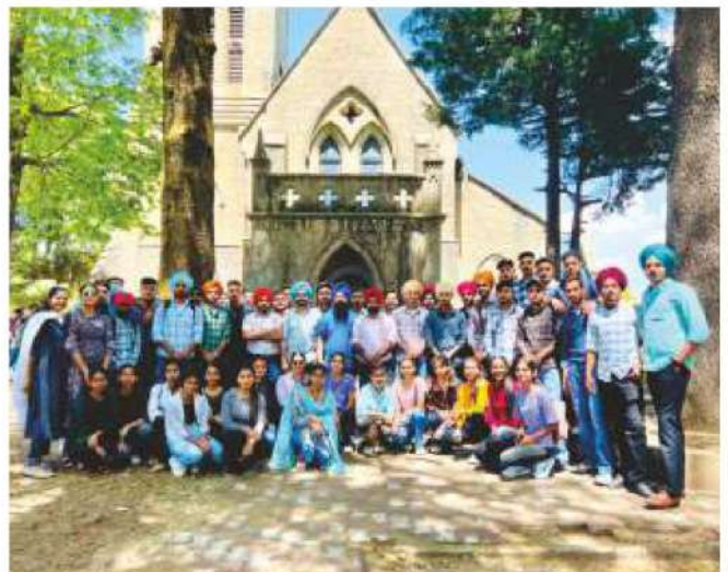
Students of The Department of Computer Science at Kasauli