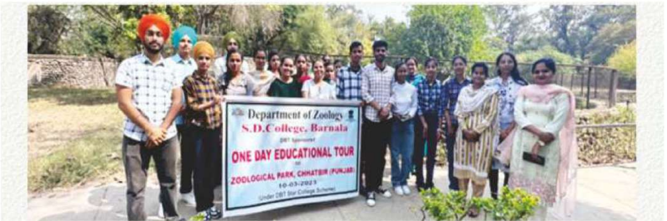
"One Day Educational Trip to Mahendra Choudhary Zoological Park, Chhatbir