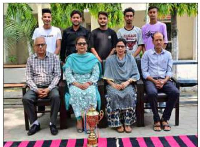
Group Shabad Team, 1st Position