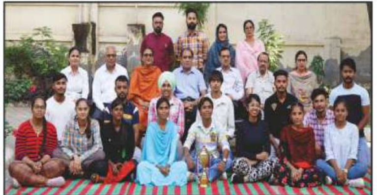
One Act Play Team, 2nd Position