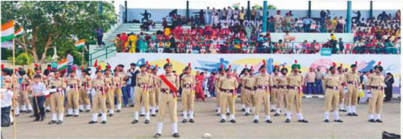
NCC Cadets Participating in District Level Independence Day parade at Kala Mehar Stadium Barnala