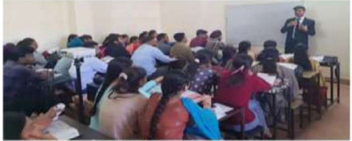
One Day Seminar on Industrial Training