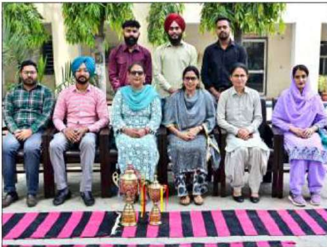
Laghu Film Team, 1st Position