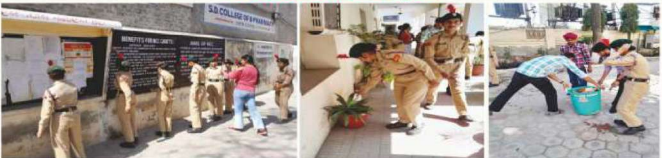
To develop the consciousness of cleanliness among the students through institutions throughout India, NCC Cadets Participated in Sawachhta Campaign on 21st March 2023