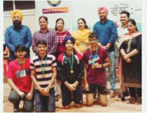
Table Tennis Team won Bronze Medal in Uni. inter College Tournament held at LBS College Barnala