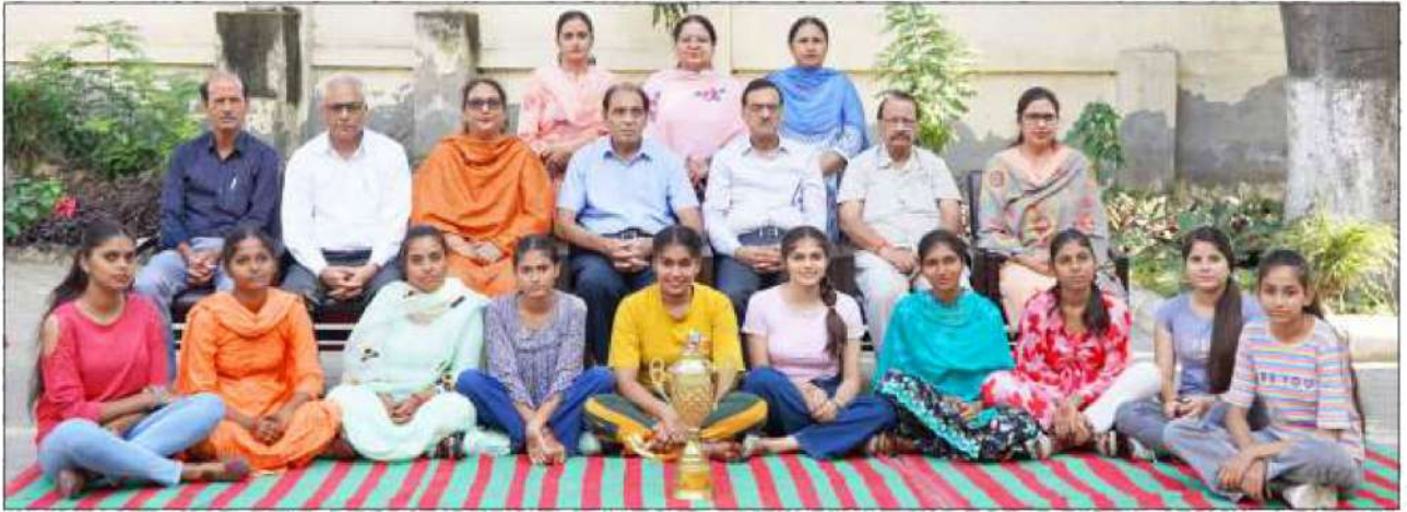
Giddha Team, 1st Position