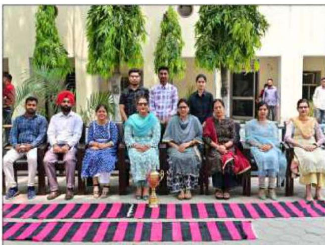
Quiz Team, 1st Position