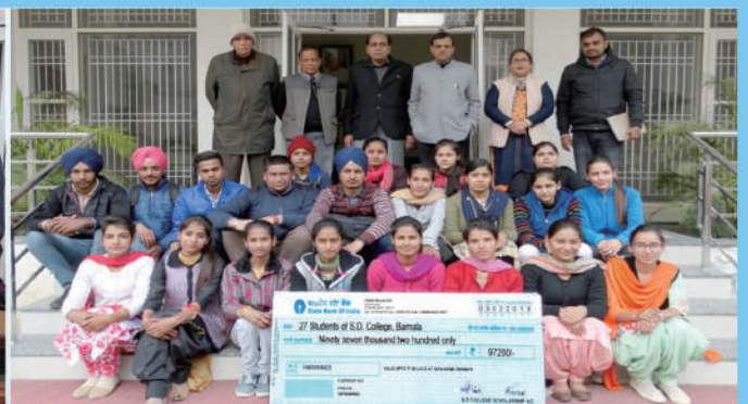
Scholarships being awarded to the students donated by Guru Harkishan Educational Society Chd.