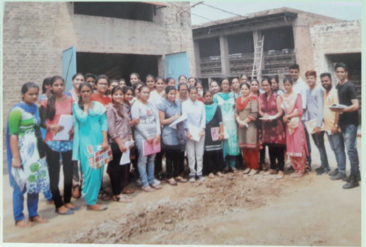
Students of BSc (Med.) at Poultry Farm