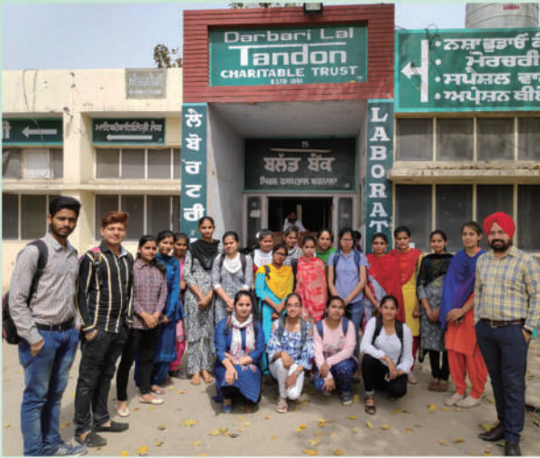
Students of BSc (Med.) at Clinical Lab. Civil Hospital Barnala