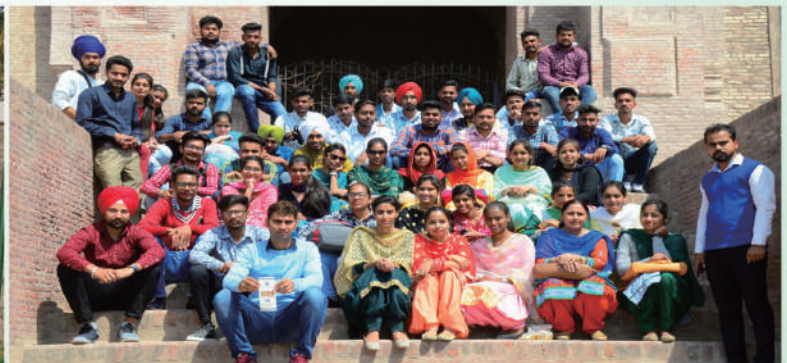
Students of at Bathinda Fort