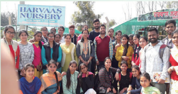
Students of BSc (Med.) at Nursery