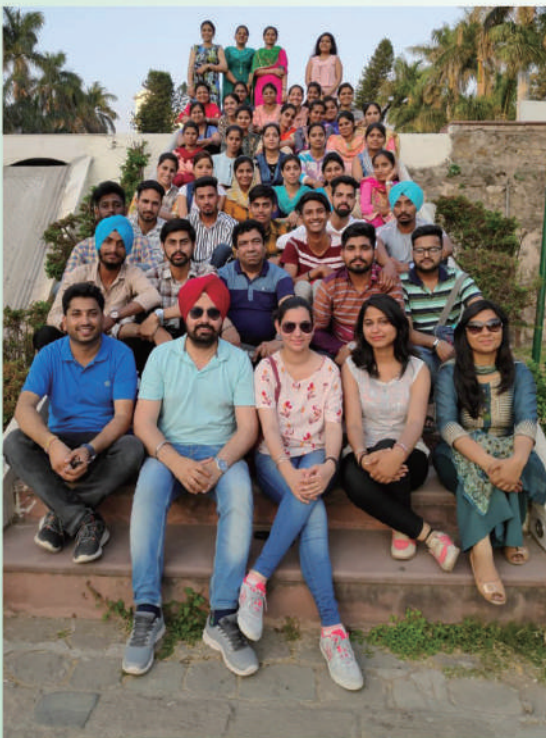
Students at Morni Hills