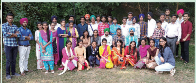
Students at Anandpur Sahib