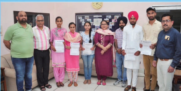
Scholarships being awarded to the Students donated by Sikh Human Development Foundation USA