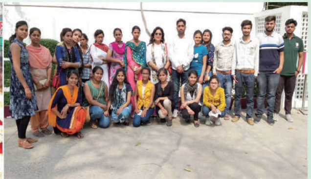
Students at Delhi Museum