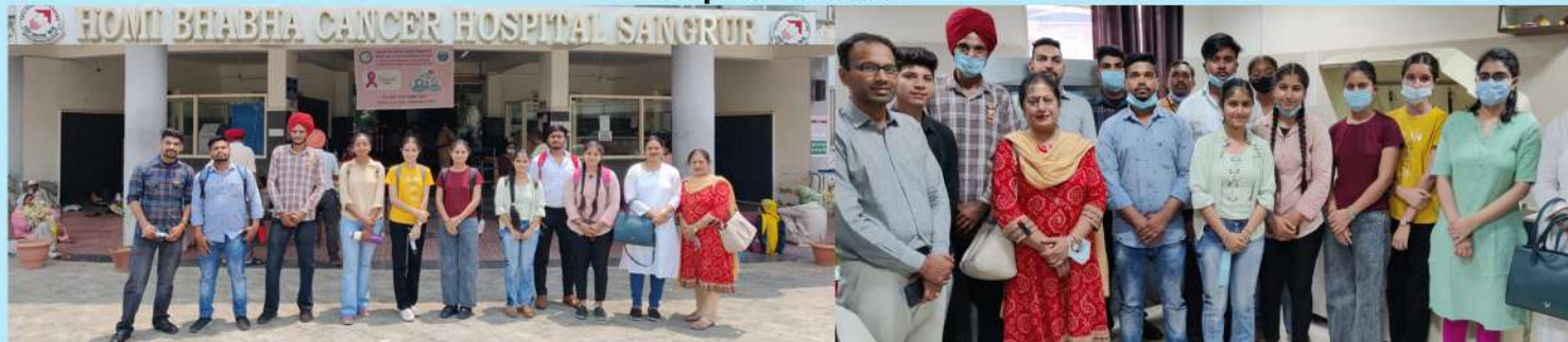
Visit to Homi Bhabha Cancer Hospital, Sangrur