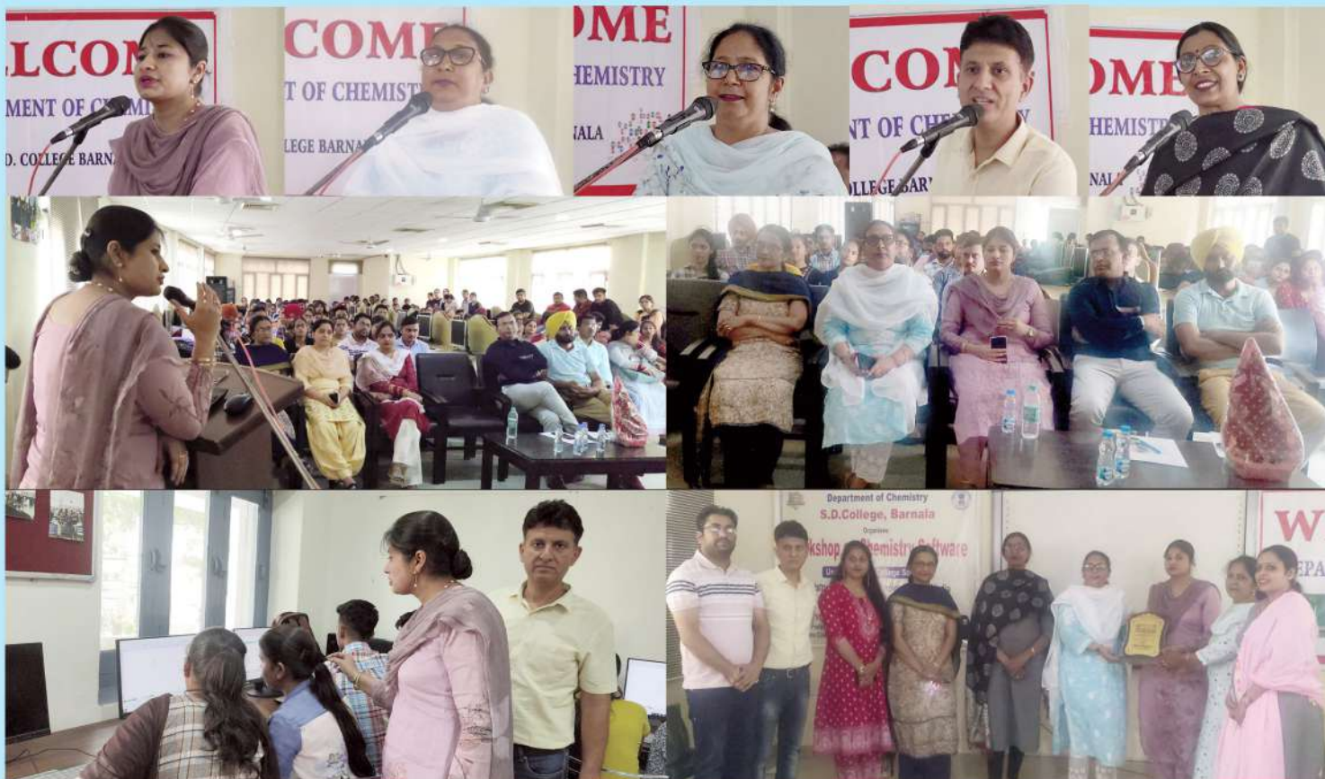
Chemistry software 'Chem Sketch'