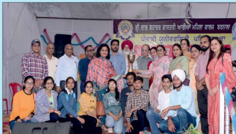
Overall Fine Arts Trophy