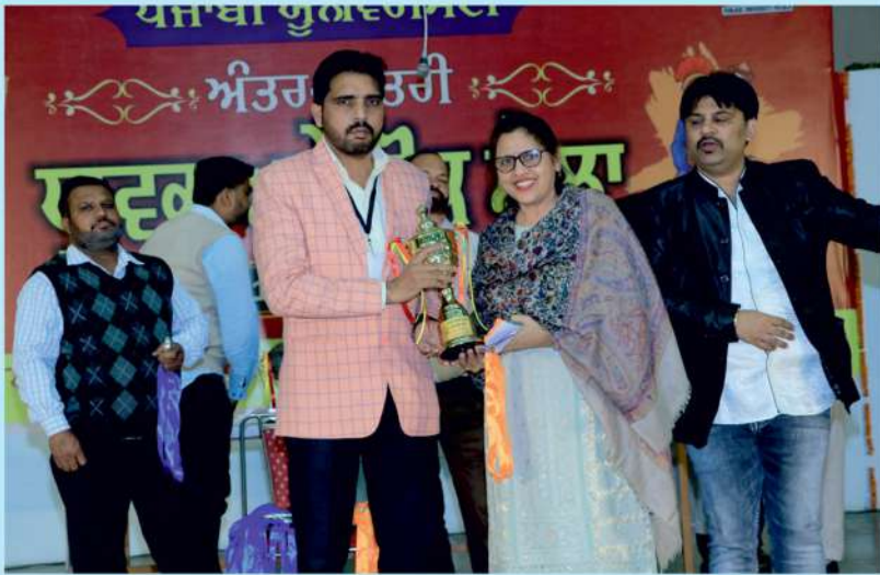
Laghu Film, 1st Position