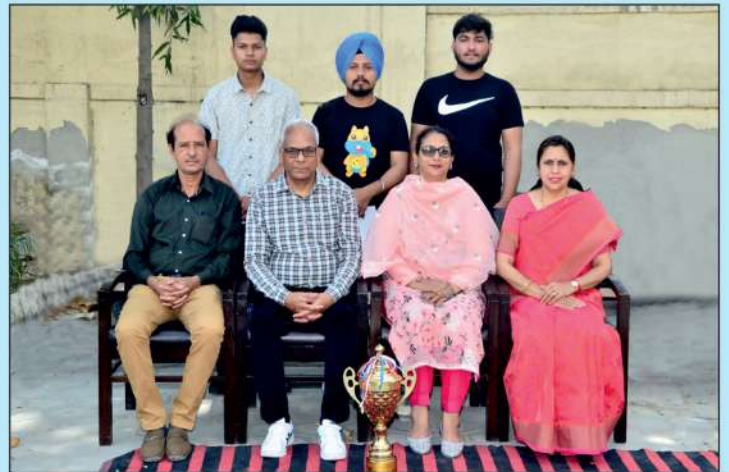
Kali Gayan Team, 1st Position Vaar Gayan Team, 1st Position