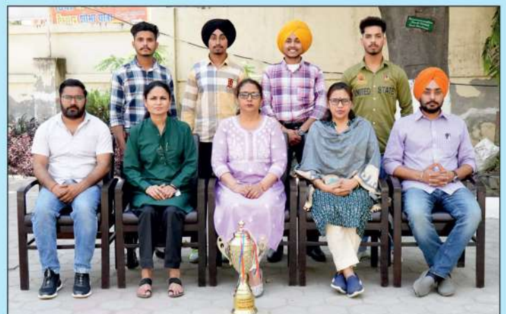
Laghu Film, 1st Position