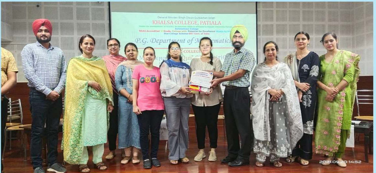
Inter-College Quiz Competition