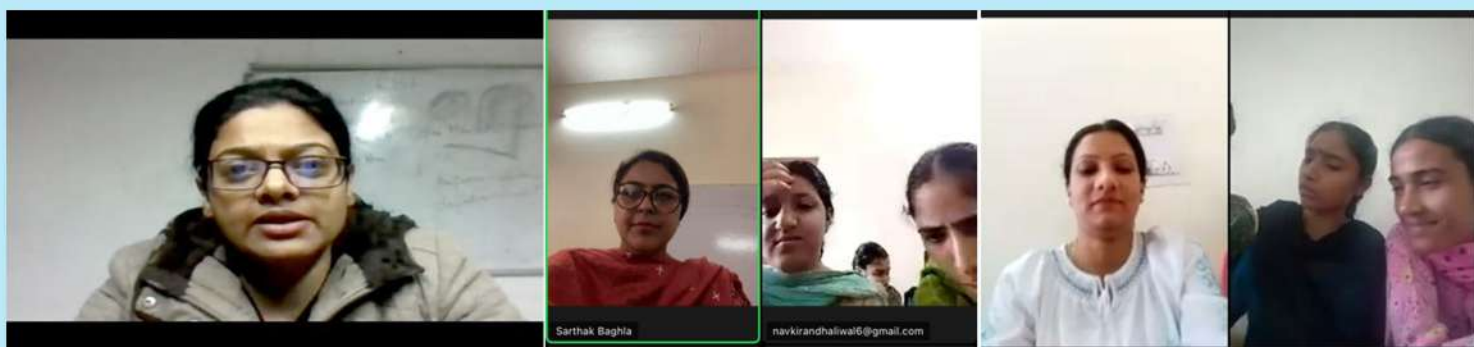
Webinar on the topic 'Humana Resourse Management, Finance marketing'