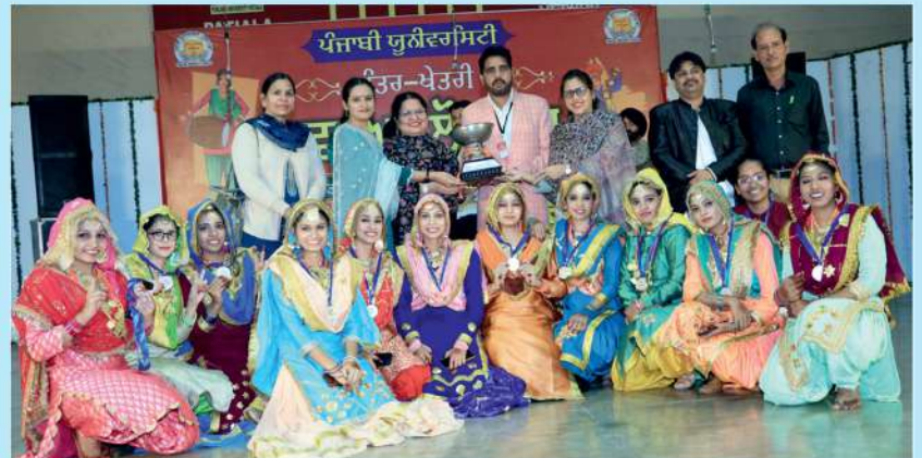
Giddha, 2nd Position