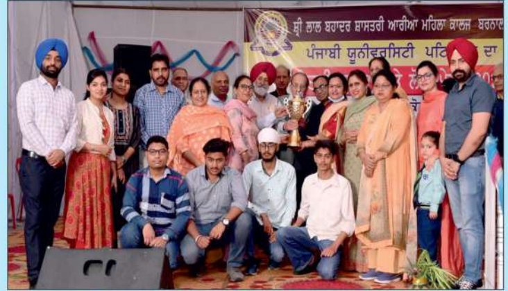
Overall Literary Items Trophy