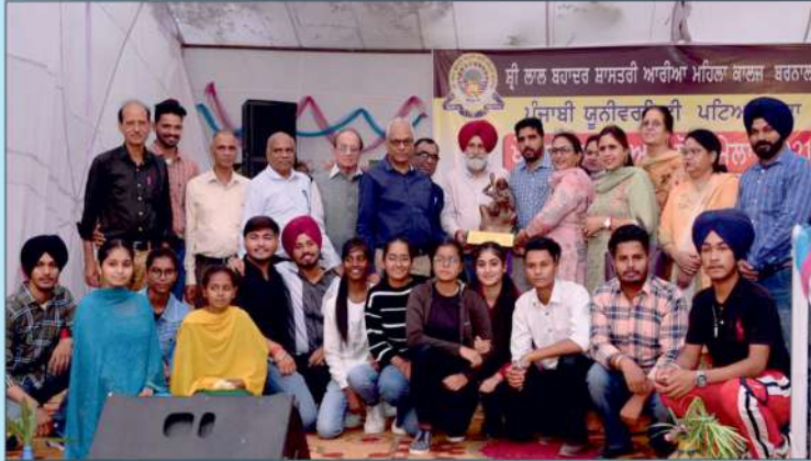
Overall Music Items Trophy