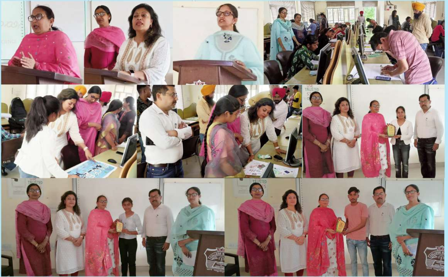
Poster Making Competition