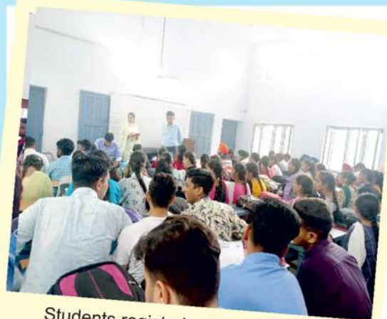
Students registering themselves for free online coaching classes run by DBEE BNL for various Govt. Sector exams