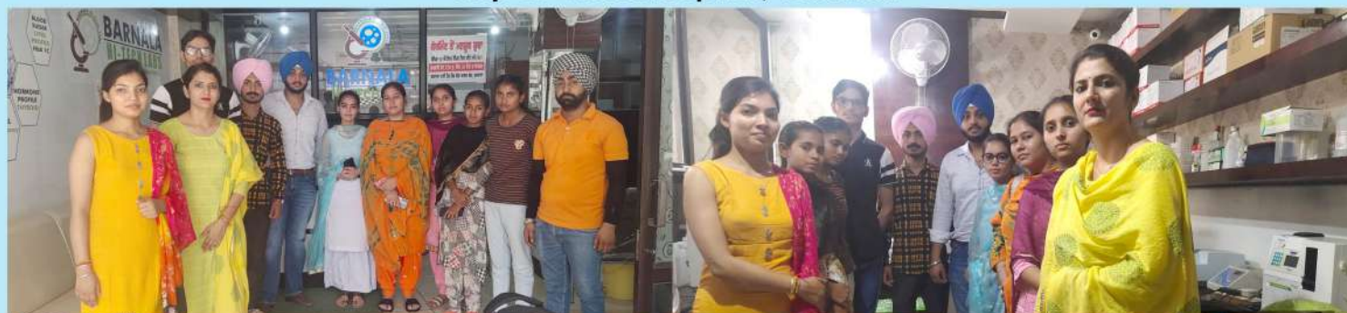
Visit to High Tech Lab, Barnala