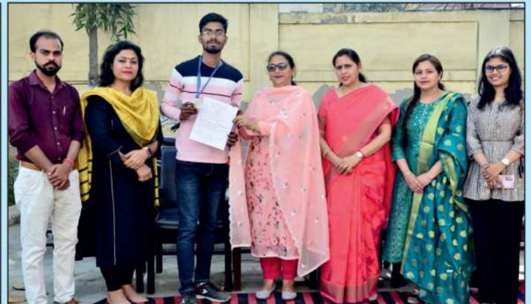
Clay Modelling, 2nd Position