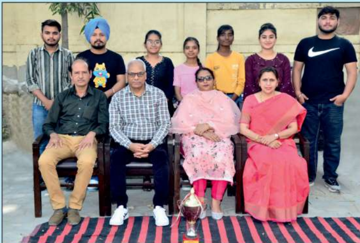
Group Song Indian, 1st Position