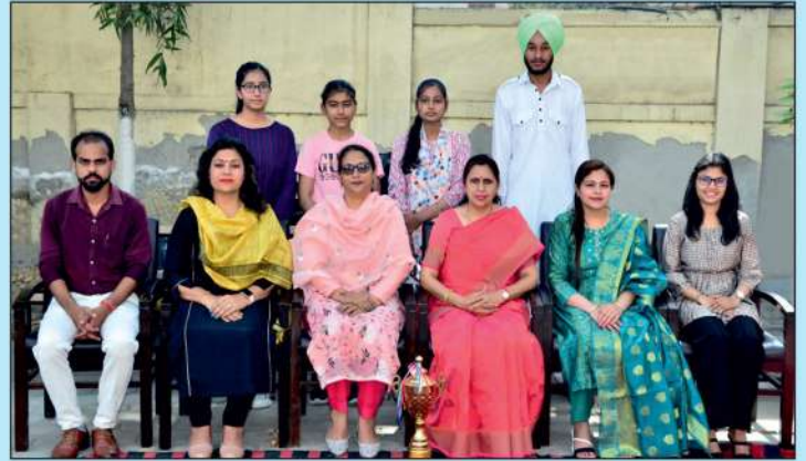
Installation, 1st Position