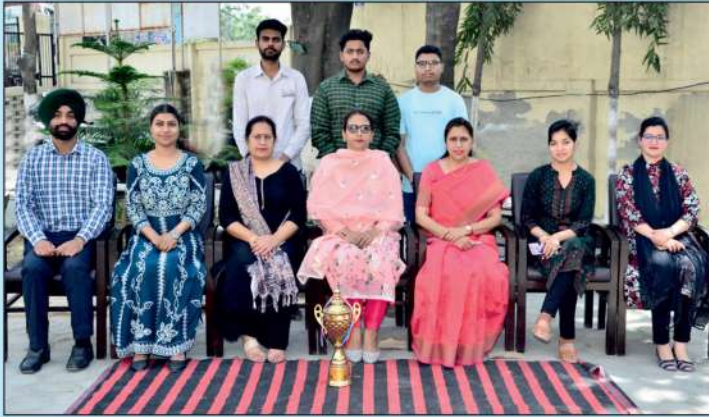
Quiz, 1st Position