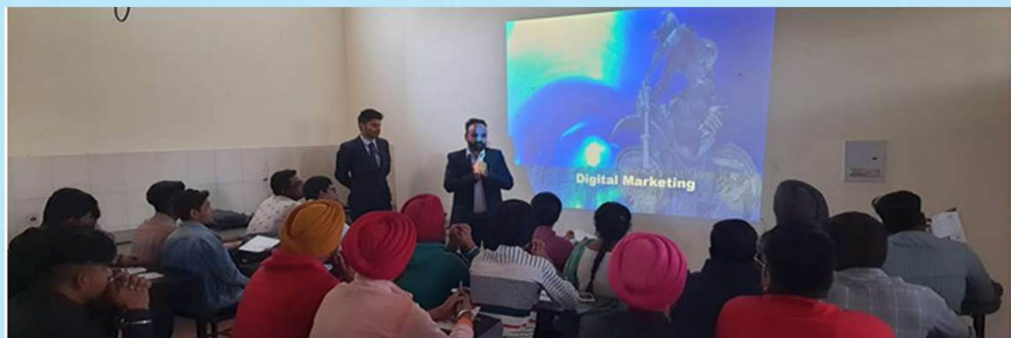
Seminar on 'Carrier Opportunities in Digital Marketing'