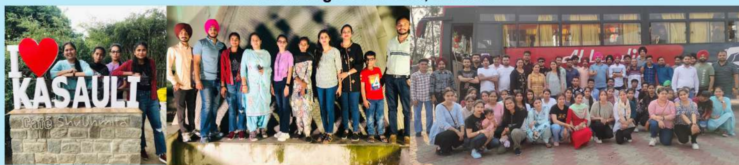
Trip to Kasuali