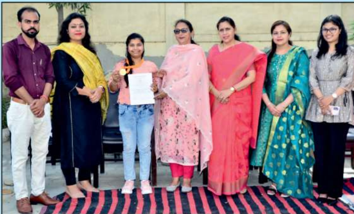
Rangoli, 1st Position