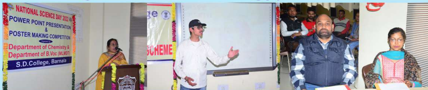
Science Day Celebrations