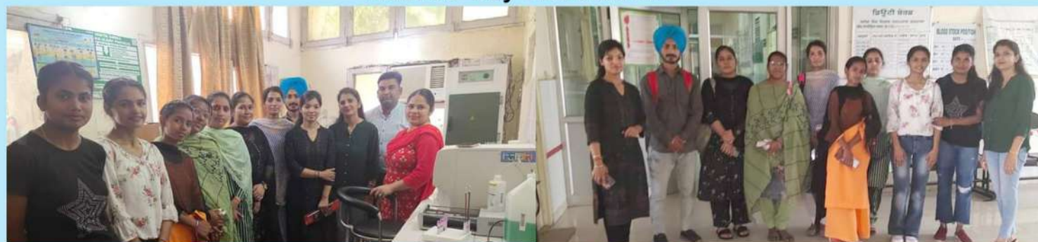
Trip to Civil Hospital, Barnala