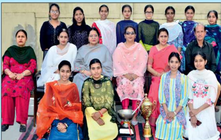
Giddha, 1st Position